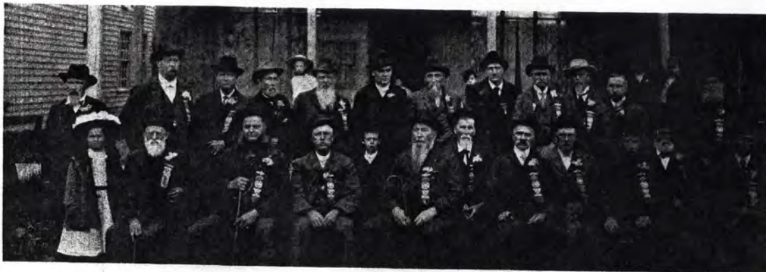
GRAND ARMY OF THE REPUBLIC Brighton Post 29 May, 1904