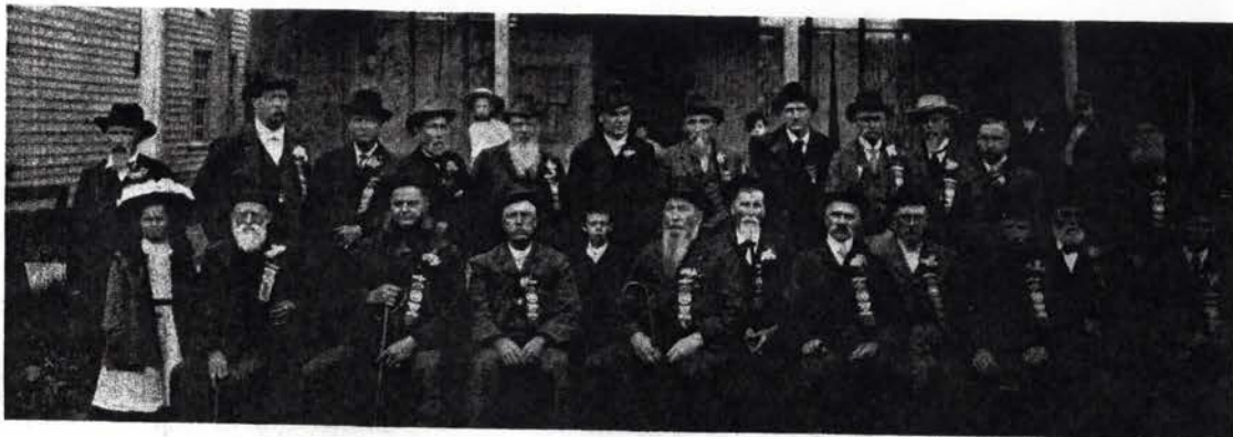
GRAND ARMY OF THE REPUBLIC Brighton Post 29 May, 1904