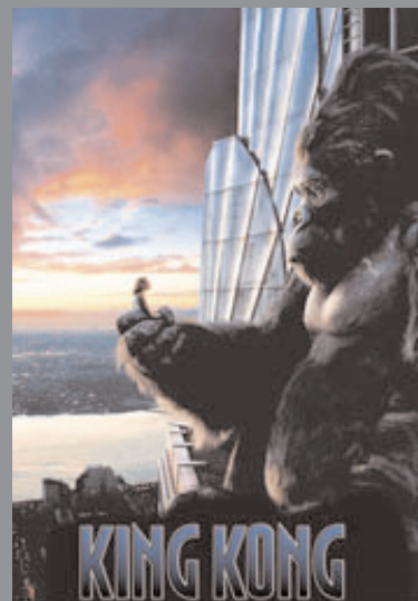
Peter Jackson's epic remake a King Kong

(Beginning Thursday, April 18th) showing at 7:30 p.m., 10:30 p.m. and 1:30 a.m. on SBU Channel 9