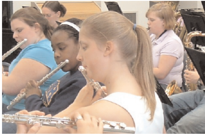
St. Bonaventure University's concert band

At 2 p.m. Sunday, April 23, student vocalists, pianists and ensembles will be featured in a Chamber Music Concert. Music will include classical works for soloists, as well as modern and jazz-influenced pieces performed by the SBU Flute, Percussion and String ensembles.