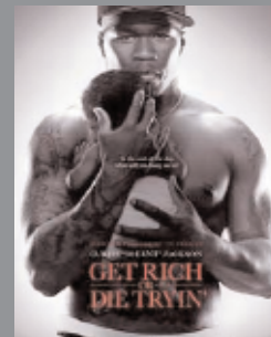
50 Cent's acting debut in Get Rich or Die Tryin'

(Beginning Thursday, April 5th) showing at 7:30 p.m., 10:30 p.m. and 1:30 a.m. on SBU Channel 9