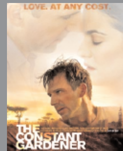
Rachel Weisz' Oscar-winning performance in The Constant Gardener

(Beginning Thursday, March. 16) showing at 7:30 p.m., 10:30 p.m. and 1:30 a.m. on SBU Channel 9