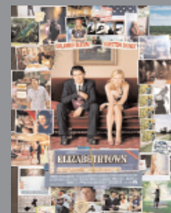
Orlando Bloom and Kirsten Dunst in Elizabethtown

(Beginning Thursday, Feb. 16) showing at 7:30 p.m., 10:30 p.m. and 1:30 a.m. on SBU Channel 9